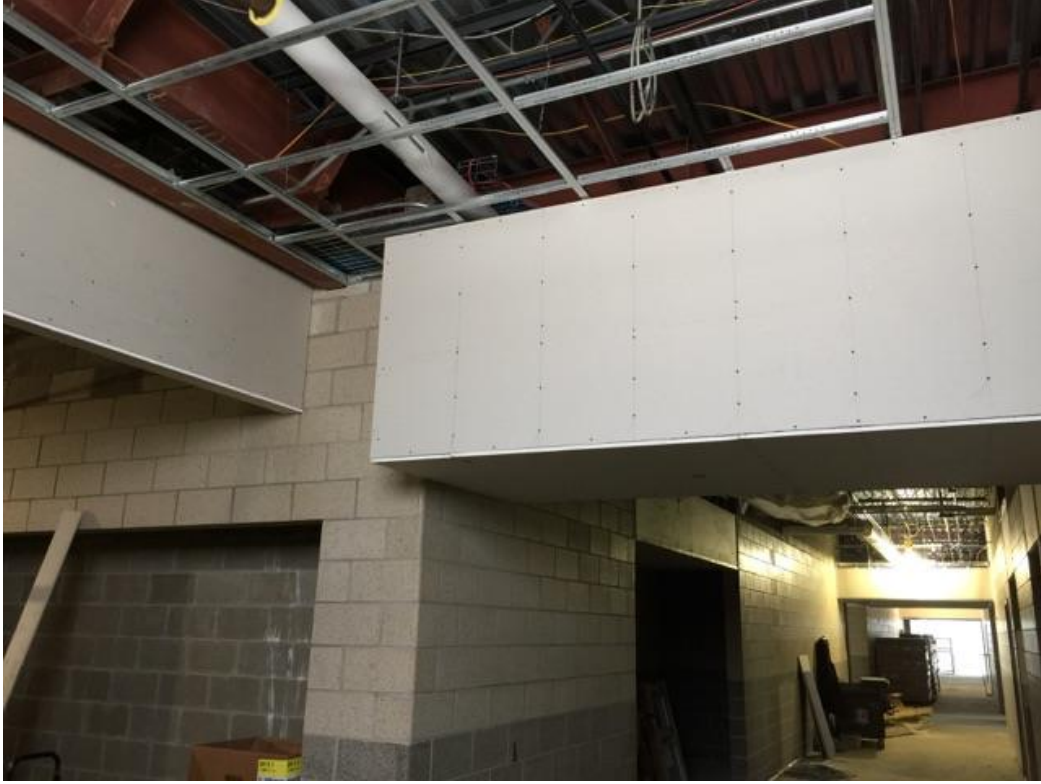
Bulk heads dry walled