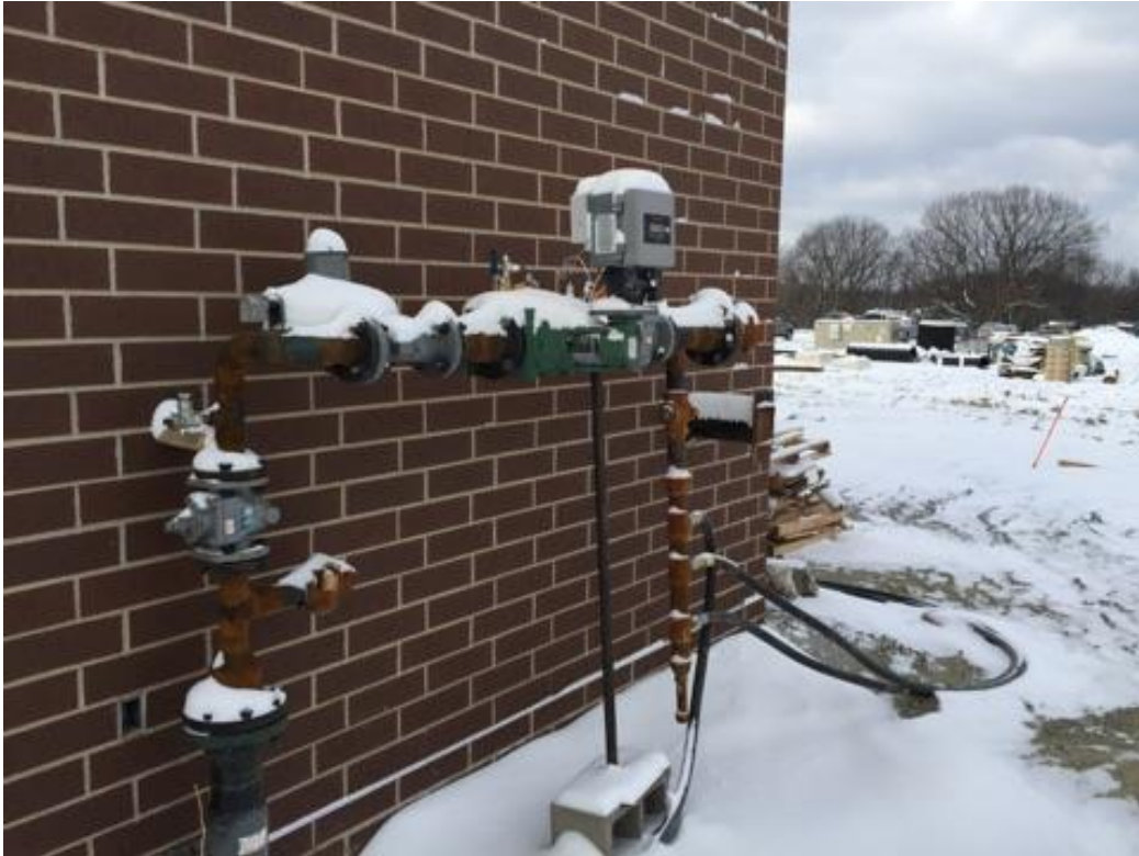
Temporary gas meter