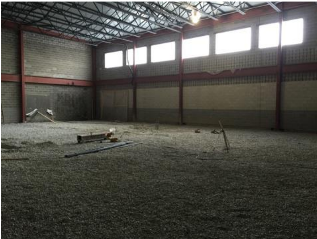
Gym floor prepped