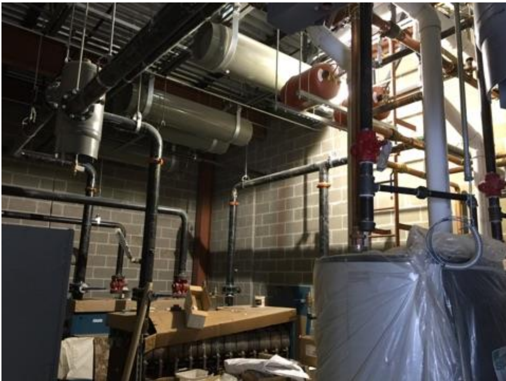
Mechanical room gas lines